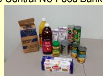
Some of the items offered in the senior program.