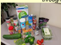
Example of items offered through the diabetic program.

New senior and diabetic programs now being offered monthly to qualifying clients through a partnership with the Central NC Food Bank.